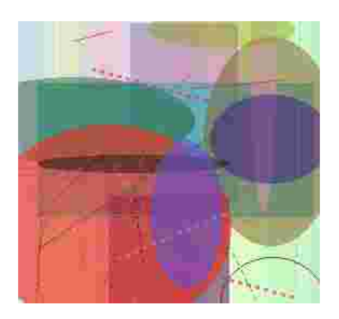
Download LibFredo6 54b